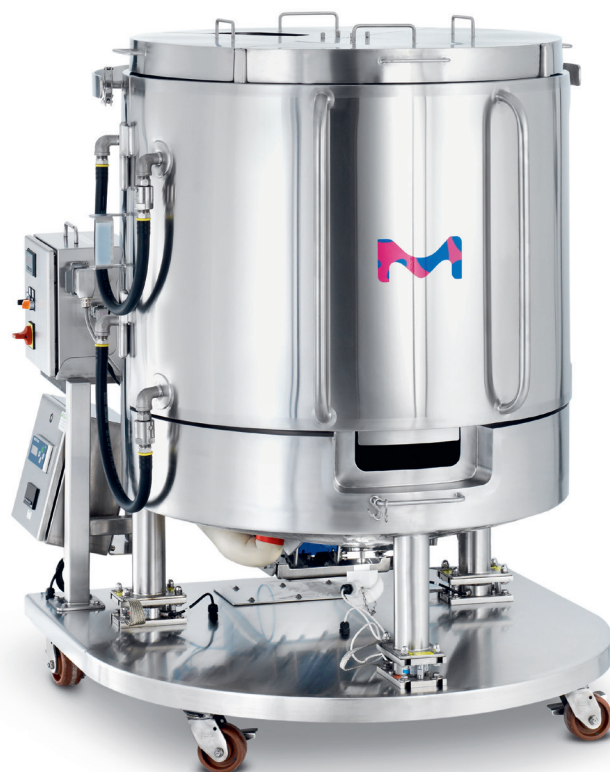
Figure 4. Mobius® Power MIX 500.

Purchasing spare parts directly from us is the only way we can guarantee that you get the right parts every time, with the same level of performance as the original. For details and ordering information, check the illustrated spare parts list ( CA7420EN ).