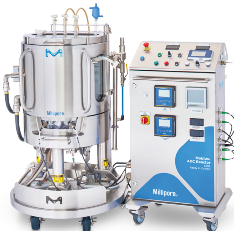
100 L Mobius® ADC Reactor with Ready to Connect Control Box.

The Mobius® ADC Reactor can be monitored and controlled locally or remotely. Plug the ready to connect control box to the network and use Ethernet IP communication protocol to monitor speed, weight, temperature, pH and conductivity remotely. The ready to connect control box is a separate box on a four wheels chassis that can be easily moved around the Mobius® ADC Reactor carrier. The 21 CFR Part 11 compliant data recorder option displays data trends in real time and ensures process data integrity when recording.