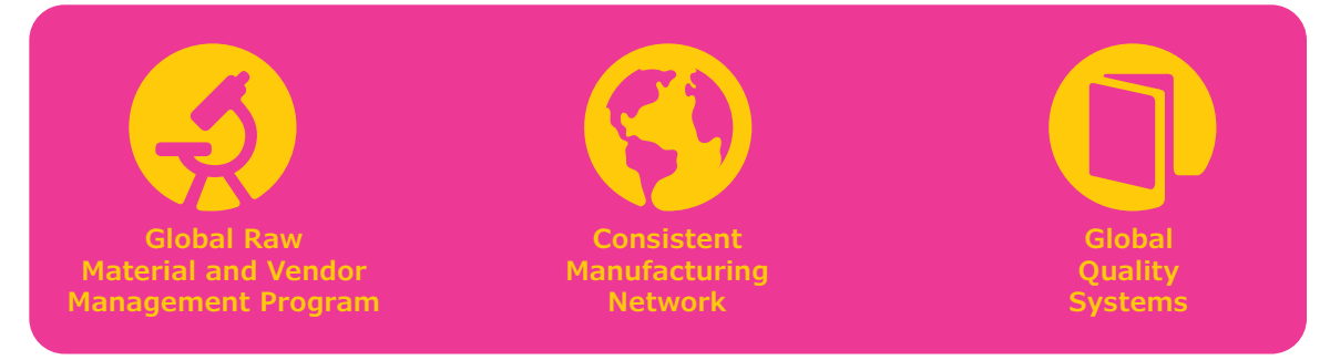
Figure 1. Our comprehensive cell culture media quality program is based on an integrated set of disciplines.

In this white paper, we highlight the breadth of programs implemented across our organization to safeguard the quality of the cell culture media that are used in our customer processes – from some of the world's highest grossing biologics to those produced on a patient-by-patient basis such as breakthrough cell therapies. Our programs represent a set of integrated disciplines focused on raw material characterization in conjunction with global supplier quality management and advanced procurement and inventory systems ( Figure 1 ).