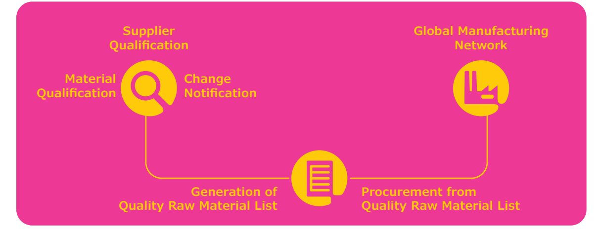
Figure 2. Procurement and inventory systems are managed locally as part of our global, unified supply chain management program.

Supplier qualification includes a requirement for transparency regarding source of materials, the process used to manufacture the material as needed, the country of origin, complete documentation and proactive change notifications. Material qualification includes extensive characterization of a number of lots, and those attributes which would be a risk for cell culture media like trace element impurities. Local procurement teams and inventory systems are integrated on a global basis to help minimize the potential for supply disruptions and allow us to share batches for raw materials between sites.