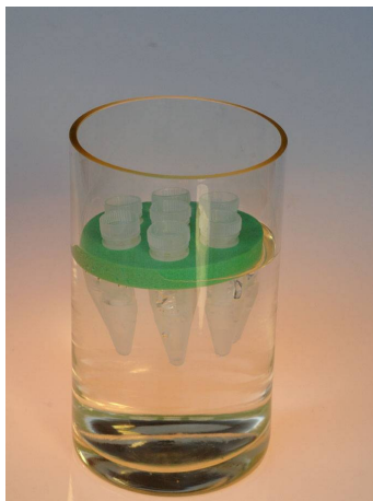
Figure 2: Dialysis with Maxi Pur-A-Lyzer.