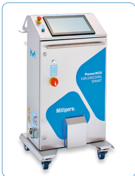
Figure 1. Smart control box.

Recipe-driven automation eliminates manual operations, increases reproducibility, and minimizes risk of errors. Reports can be easily generated from scratch or from pre-defined templates. An interactive P&ID allows users to visually monitor the process and control each of the components from the Human-Machine Interface (HMI) or from anywhere through a browser-based interface.