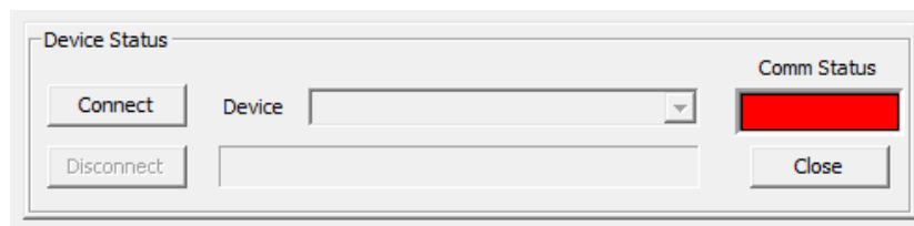
Figure 3 - Scepter Utility Close Button

Click the “Close” button on the user interface to close and exit the utility.